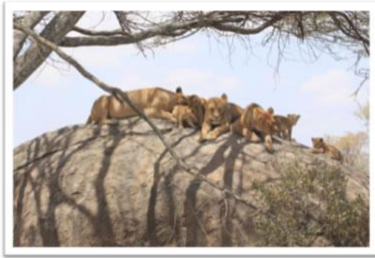
Lion taking nap at noon time